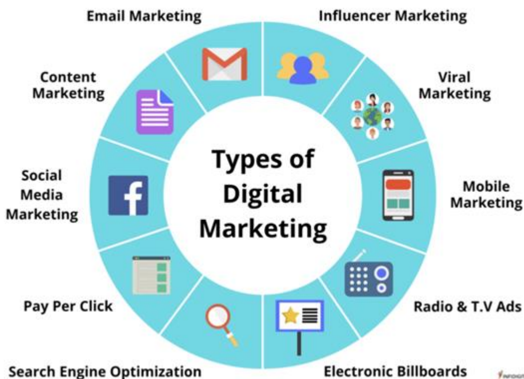
Figure 1. digital marketing( https://www.infdigit.com/blog/what-is-digital-marketing/ )

the way consumers interact and transact with businesses, creating a multitude of opportunities and challenges. On one side, digital marketing and technology are responsible for transforming consumer behavior, but it is essential to understand that consumer behavior is shaping digital marketing. The exponentially growing digital shift means that everybody uses social media, smartphones, apps, and other devices to discover and communicate with brands. That has been further accelerated by the Covid-19 pandemic, which has forced people to live in an e-commerce world as they cannot leave their homes (Manisha & Shukla 2016)