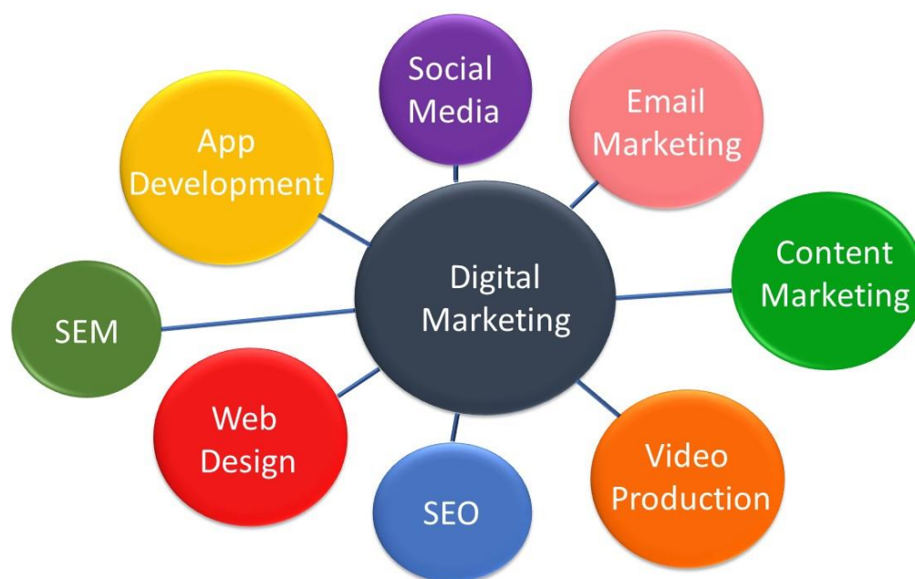
Fig.1. digital marketing( https://www.infidigit.com/blog/what-is-digital-marketing/ )

consumer behavior is probably a massive understatement. Digital developments drive the way consumers interact and transact with businesses, creating a multitude of opportunities and challenges. On one side, digital marketing and technology are responsible for transforming consumer behavior, but it is essential to understand that consumer behavior is shaping digital marketing. The exponentially growing digital shift means that everybody uses social media, smartphones, apps, and other devices to discover and communicate with brands. That has been further accelerated by the Covid-19 pandemic, which has forced people to live in an e-commerce world as they cannot leave their homes